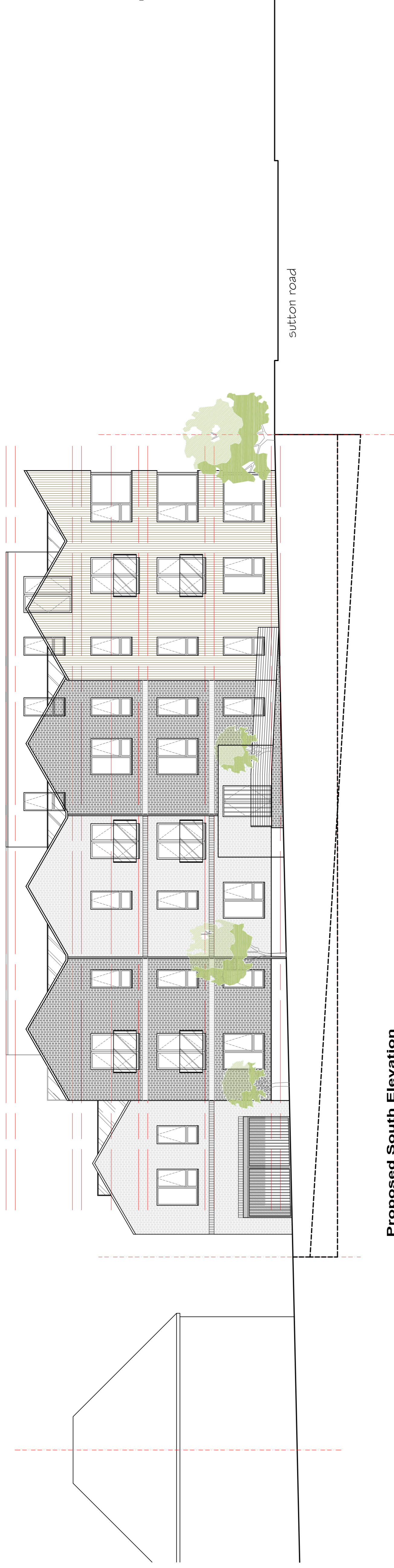
Proposed South Elevation - Maldon Road